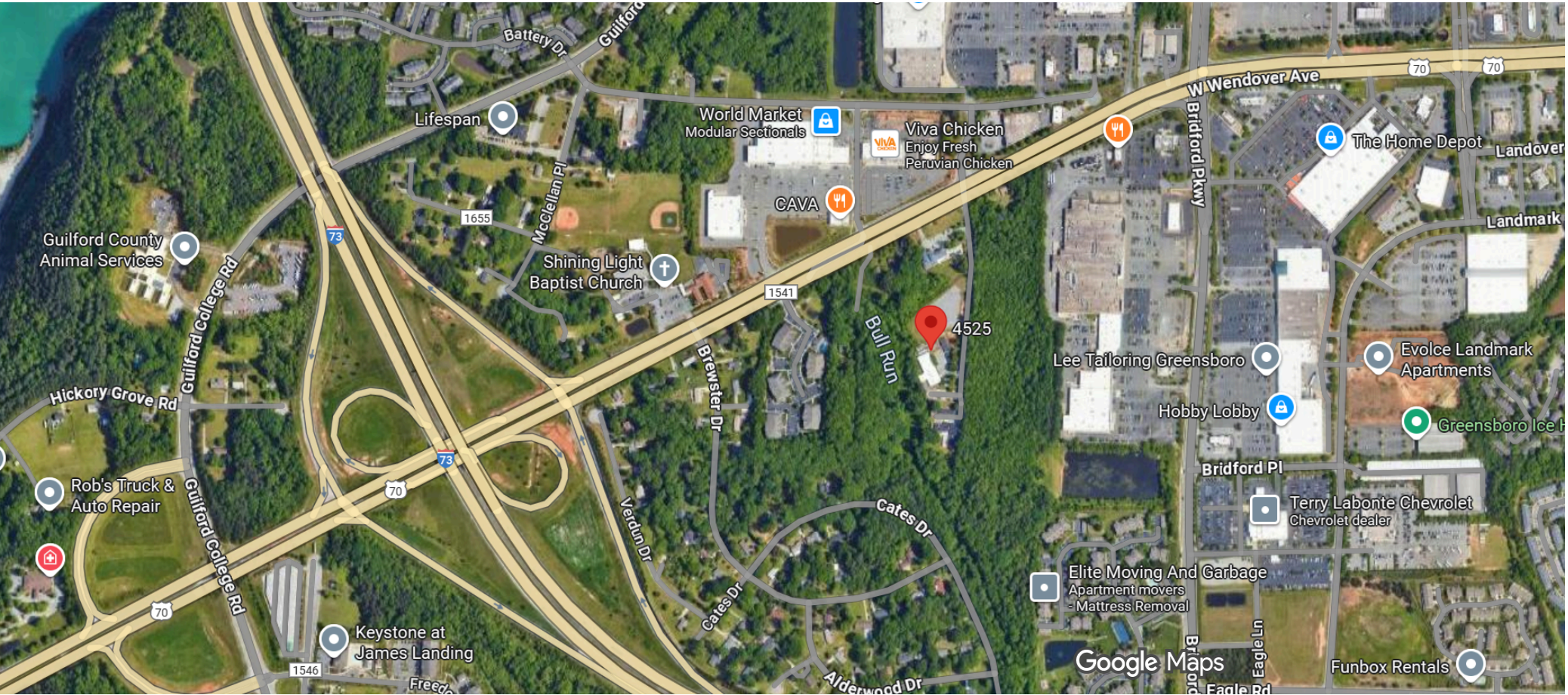
500 ft